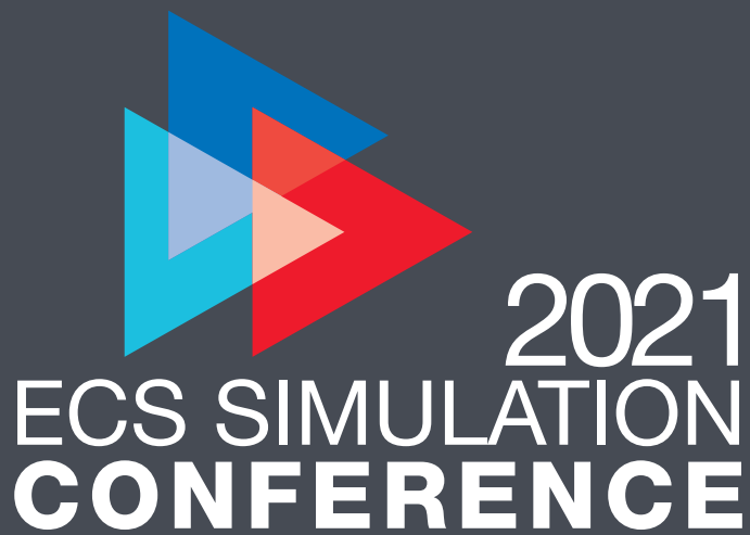
EXHIBIT WITH US! ONLINE | MAY 19 th - 20 th